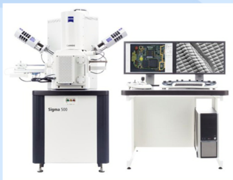
Thermal Field Emission Scanning Electron Microscope (SEM) (Room 106, Building 16)

More Equipments and public facilities were put into use.